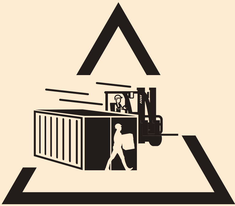
PERSON VS MACHINE