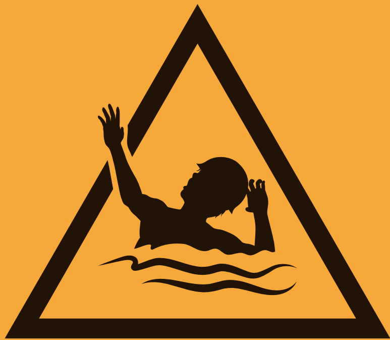
SUDDEN IMMERSION IN WATER