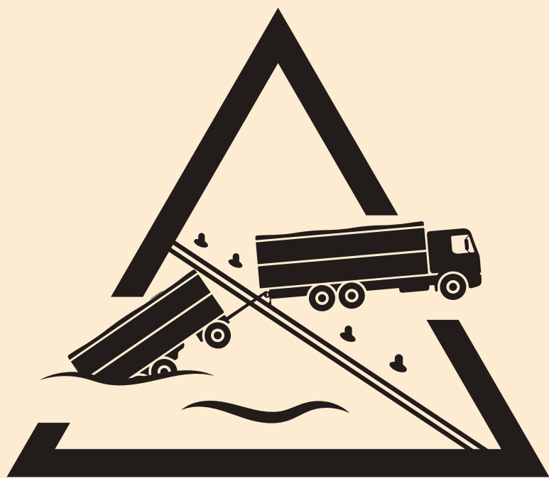
VEHICLE OVER WHARFS EDGE