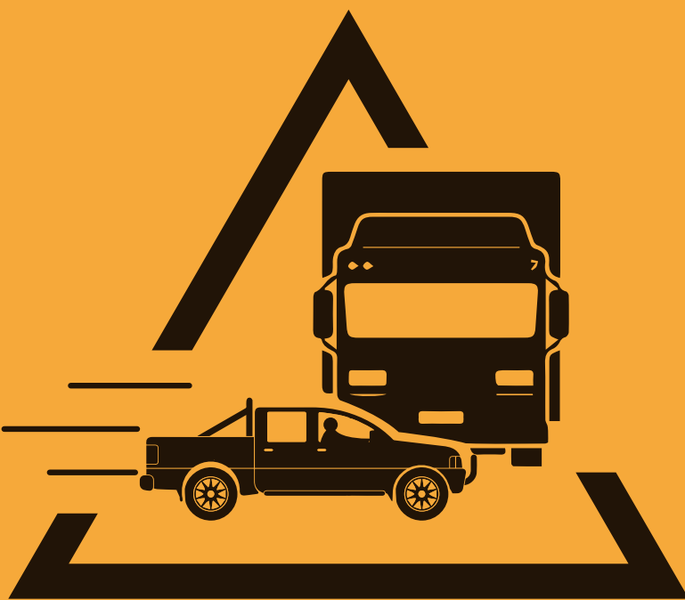
LIGHT VEHICLE VS HEAVY VEHICLE