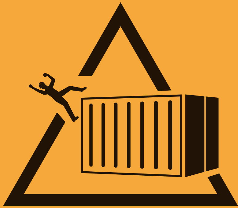
WORKING AT HEIGHT