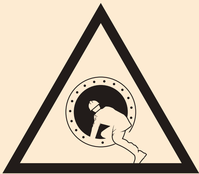
WORKING IN A CONFINED SPACE