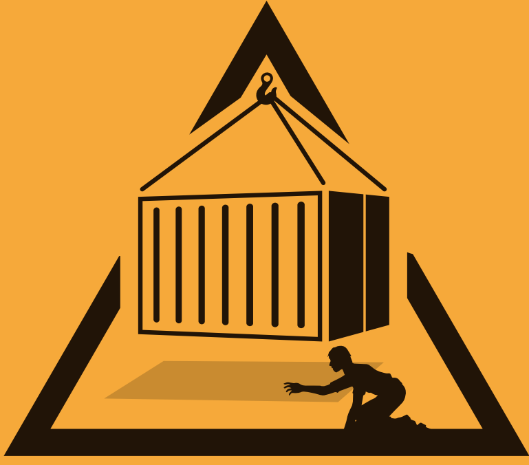
SUSPENDED LOADS, DROPPED OBJECTS